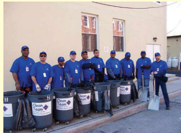
Clean Team worker trainees clean up the streets of Allentown, while learning valuable workplace skills such as safety, promptness, listening, following work rules, cooperation and productivity.